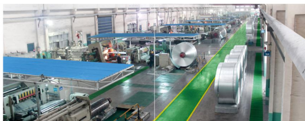
22 Continuous Casting Lines Production Capacity: 250,000 tons Thickness(mm):6.0-8.0mm Width(mm): 700-1850mm