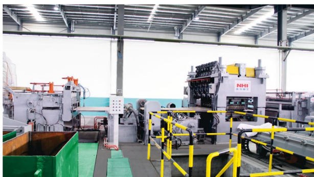
8 Aluminums Foil Lines Production Capacity: 120,000 tons Thickness(mm):0.005-0.2mm Width(mm):50-1700mm