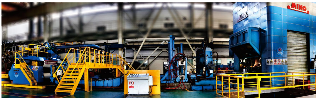
The Hazelt Continuous Casting and Rolling Lines Production Capacity: 250,000 tons Thickness(mm):2.0-7.0mm Width(mm): 1935mm max

Our plant are now equipped with 22 continuous casting lines, 10 cold rolling lines, 8 foil rolling lines, 9 coating lines and other re-winder and slitting totally hundreds of equipment.