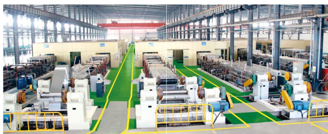
9 Coating Lines Production Capacity:100,000 tons Thickness(mm):0.08-0.2mm Width(mm): 150-1400mm