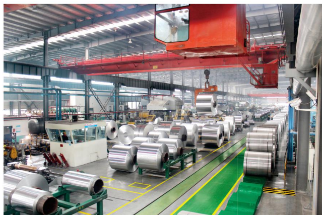
10 Cold Rolling Lines Production Capacity:350,000 tons Thickness(mm):0.03-3.0mm Width(mm): 150-1900mm